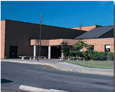
Defiance Area YMCA, Defiance, OH