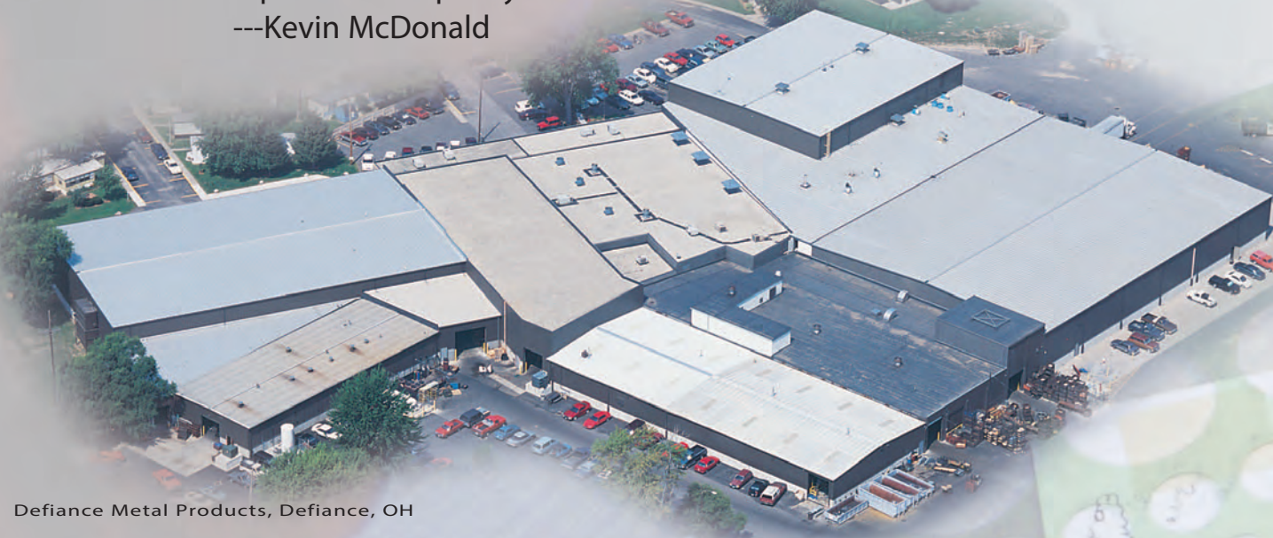
Defiance Metal Products, Defiance, OH