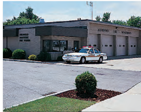
Archbold Fire Station, Archbold, OH

McDonalds' Design & Build, Inc. has consistently received an excellent Experience Modification Rate from Ohio State Workers Compensation, based on occurrences of on-the-job accidents. We strive to be OSHA compliant.