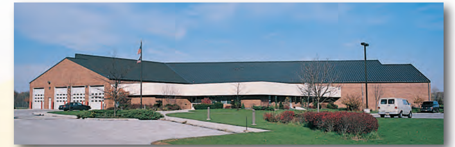
Ohio Department of Transportation, Defiance, OH