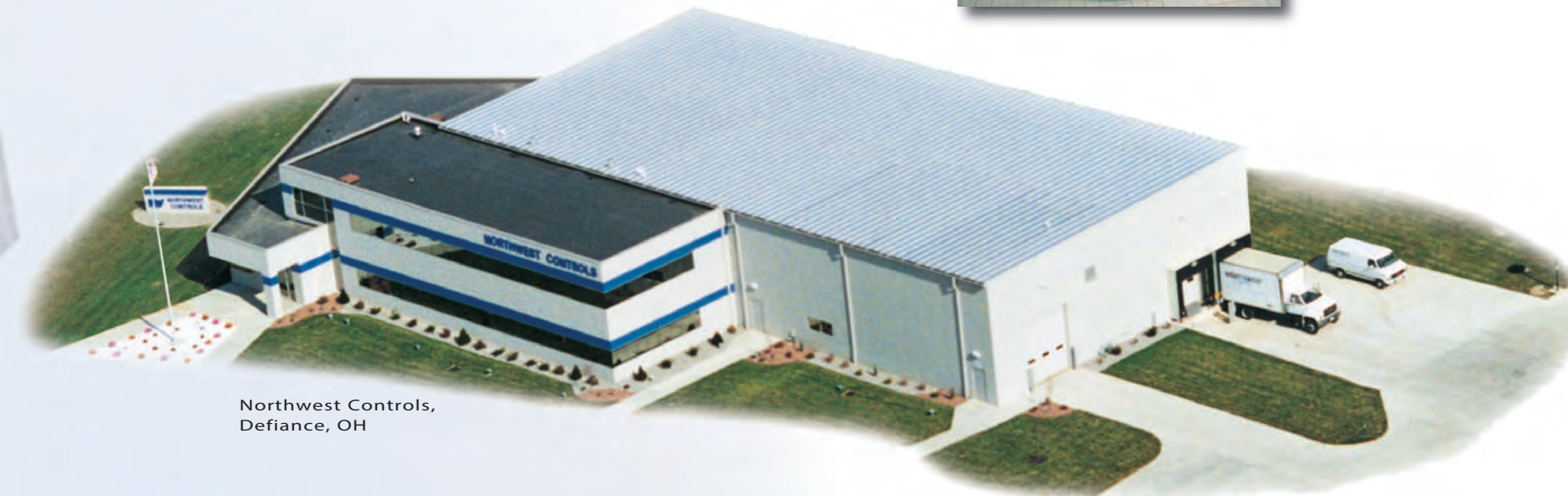
Northwest Controls, Defiance, OH