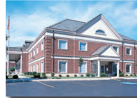
First Federal Savings & Loan, Defiance, OH

Whatever you have in mind, McDonalds' Design & Build, Inc. will eagerly accept the design challenges. We can originate an aesthetically appealing plan that will realize your building purpose, location concerns, and even consider your expansion goals.