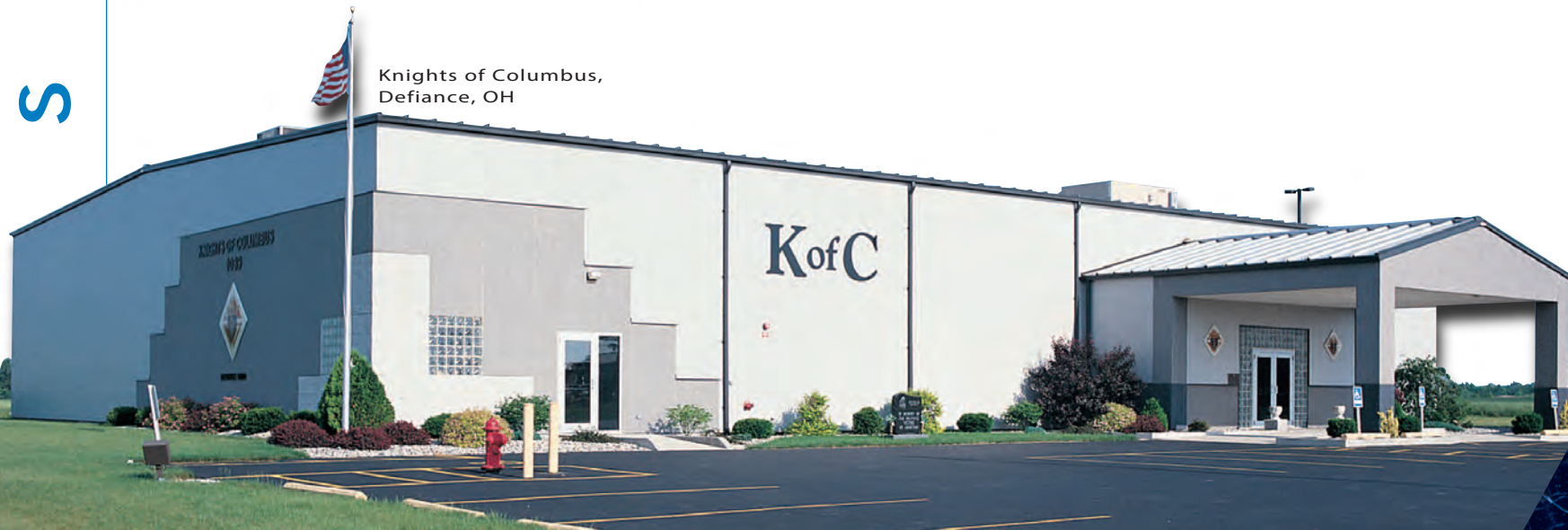
Knights of Columbus, Defiance, OH