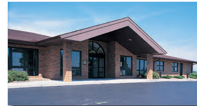
Hicksville Community Memorial Hospital, Hicksville, OH

Whatever you have in mind, McDonalds' Design & Build, Inc. will eagerly accept the design challenges. We can originate an aesthetically appealing plan that will realize your building purpose, location concerns, and even consider your expansion goals.